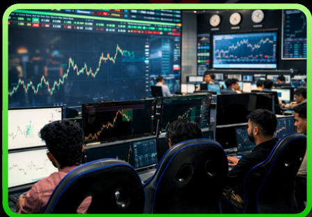
JHARKHAND'S FIRST TRADING FLOOR