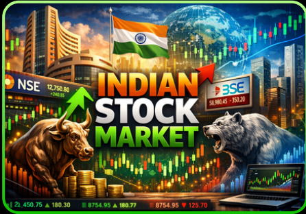
INDIAN STOCK MARKET