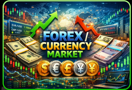
FOREX / CURRENCY MARKET