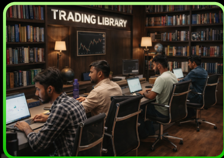
INDIA'S FIRST TRADING LIBRARY