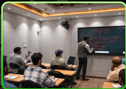
SMART DIGITAL CLASS